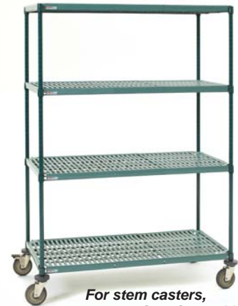
For stem casters, see catalog sheet #11.20